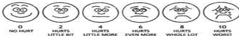
Wong-Baker FACES Pain Rating Scale