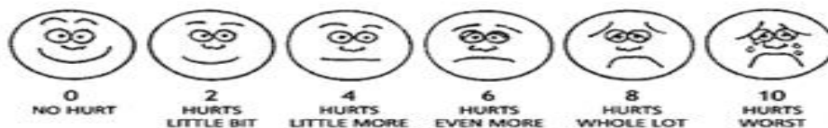
Wong-Baker FACES Pain Rating Scale